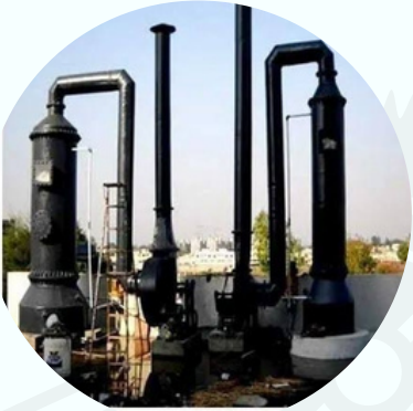
HDPE SCRUBBING SYSTEM