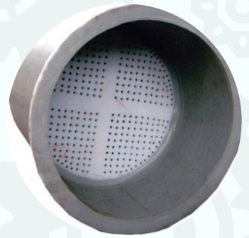
PP FILTER NUTSCHE