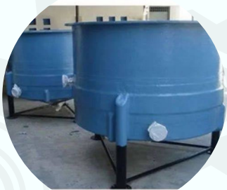
PPFRP FILTER NUTSCHE