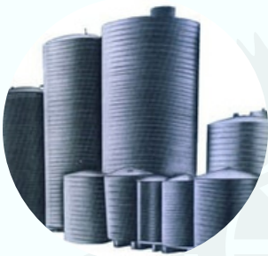
HDPE STORAGE TANKS