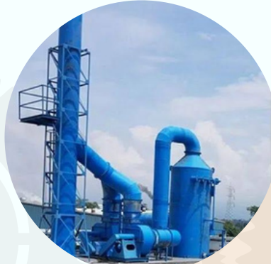
PPFRP SCRUBBING SYSTEM