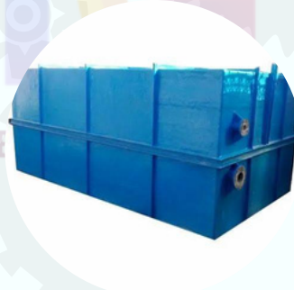
FRP SQUARE TANKS