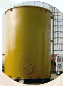
PPFRP STORAGE TANK