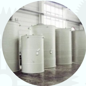
PP STORAGE TANK