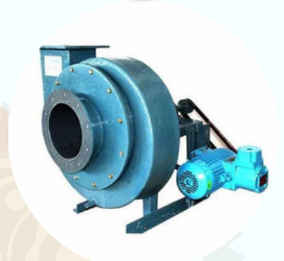
PPFRP BLOWER 1 HP TO 25 HP