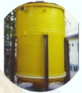
PPFRP REACTOR VESSEL