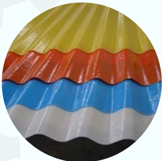
PPFRP CORUGATED SHEETS